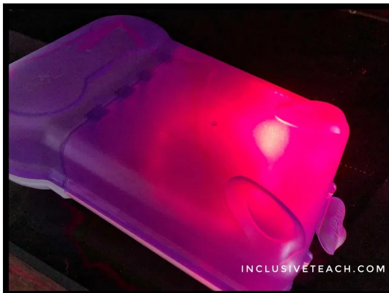
Light in a tupperware container sensory learning idea.

Washing up liquid and food colouring experiment